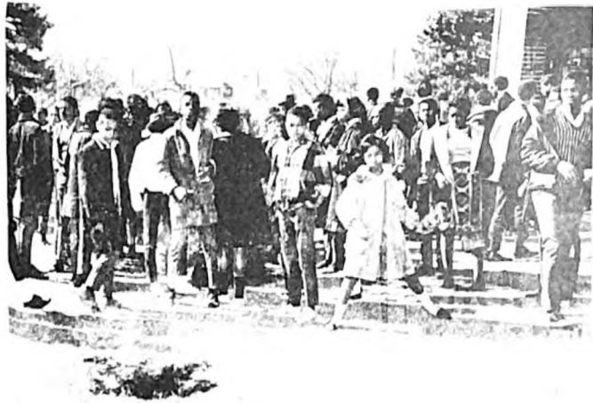
Students gather at Mann Junior High School... While small grass fire burns in left foreground.