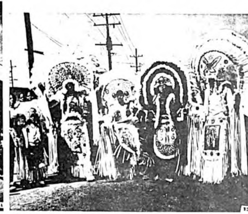
NEW ORLEANS, COMMEMORATING its 20th Anniversary, celebrated its biggest and maddest Mardi Gras ever ending midnight Tuesday. The crowds were estimated to be the largest ever to participate in the joyous, 10-day fete. Along with the traditional Parades and Balls were boatrides, parties, and other