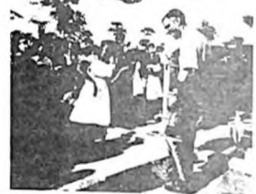
During festivities at St. Patrick's Hospital, Williams engages in native drum dance (called durbar) with a nurse.

THE GOVERNMENT OF Ghana didn't hold a parade when President Johnson appointed Franklin H. Williams as our ambassador to that country. They weren't that thrilled about the idea. After all, Williams was a Negro and the Africans weren't too sure a Negro would have much influence in getting Washington to help Ghana. That was two years ago. Today, most Ghanians regard Williams as a good friend as well as an ideal ambassador. Besides gaining $30 million in aid for their country last year, Williams has proven himself genuinely interested in Ghana's problems. He's constantly traveling around the nation, meeting with tribal chiefs and officials, dedicating schools and hospitals. He feels Ghana can achieve self-sufficiency by increasing opportunities for its youth.