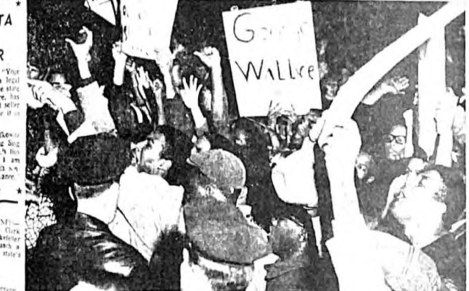
Just before the fight... Demonstrators jeer Wallace.