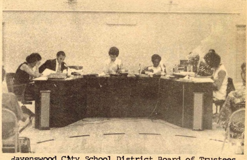
Ravenswood Caty School District Board of Trustees

DIFFERENCES IN PERCENT OF USAGE - 1969 AND 1970 STUDIES "ANY USE" AND "TEN OR MORE TIMES USAGE" BY SCHOOL GRADE AND SEX