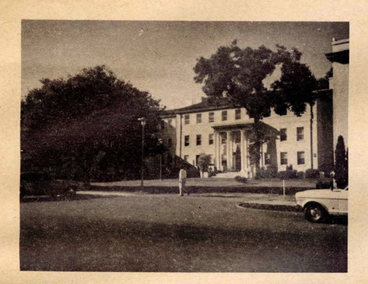
Menlo Park VA Hospital.

cohol or whatever. This is the longest and most difficult phrase. For one it began at Fort Dix, New Jersey in the early sixties, The third phrase invovles finding a job but are allowed to live at the hospital until you have enough money to make it. In phrase four you're on your own but can still ome back anytime you have a