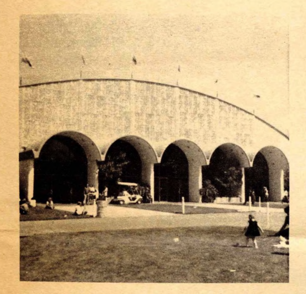
This is one of the Exibit Halls.

The San Mateo County Fair is in action again. The fair began July 26th and is to continue until August 7th. The fair grounds open at 12 a.m to 12 p.m. The admission for Adults is $1.50, for ages 12-16 is 50¢ and 11 and under are free. There is a lot of excitement and enjoyment for all ages. There are rides known as the Tilt-a-Whirl, Trabant, Bumper cars, Hammer and many others. Also many displays there are for the whole family to see. You can also lose your money at the fabulos horse races which are across from the fair. The horse races are daily from 1 p.m until 5 p.m except Sundays.