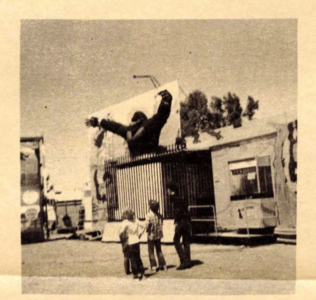
A caption of the Fun House

Maybe the next meeting will be congenial for everyone, public included.