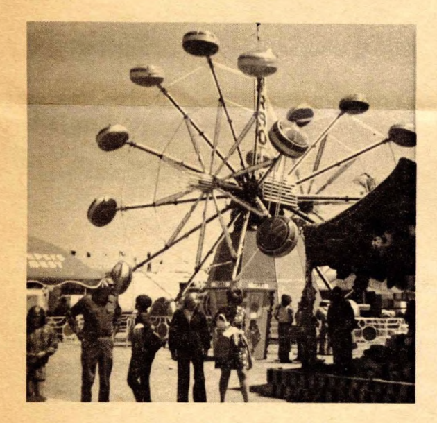
This ride is called Turbo

So don't you and your friends forget to attend the San Mateo County Fair.