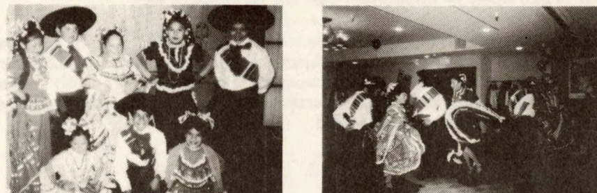
Some of the members of the children's group.

For four consecutive years, Raices de Mexico has performed at the University of California Cinco de Mayo celebrations held at the Greek Theater in Berkeley, as well as for the Medical School at San Francisco State University, including other primary and secondary schools in the Bay Area.