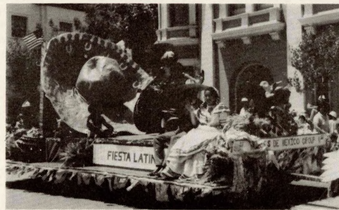
Redwood City 4th of July Parade 1984

Entering its sixth year, Raices de Mexico, a non-profit association, has donated its services to entertain senior citizens and war veterans. The Group has done fund-raisers, participated in community functions, parades, grand openings and school celebrations. Raices de Mexico has presented shows around the Bay Area, from Mt. Diablo, San Francisco to San Jose.