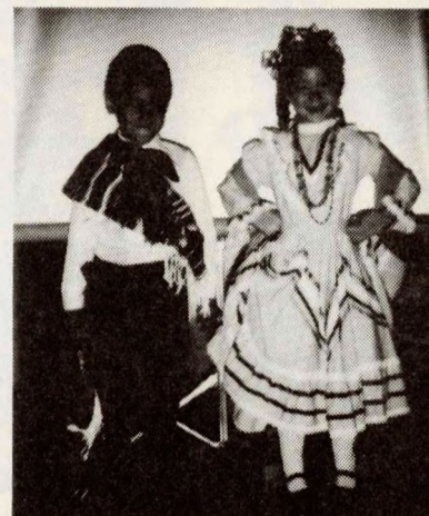
A couple from the children's group.

Five years ago an ambitious political science graduate from Berkeley decided he wanted to do something significant for the East Palo Alto community where he lived. He wanted to keep alive his Mexican ancestral roots by teaching his folkloric knowledge to the youth of the community, this he decided was better than politics. Consequently, "RAICES DE MEXICO" was born.