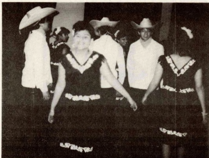
Tamaulipas — Querreque

The Group's objective is to grow, improve, and continue enhancing the community by presenting cultural programming of exceptional quality thru our music and dance, as well as educating each dancer about Mexican music folklore.