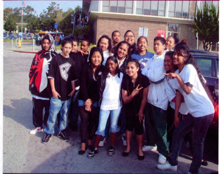
Web@One After School Program students take a special field trip to Menlo-Atherton High School, February 2008.

During the 2007-2008 school year, OEPA managed the Where Everyone Belongs (WEB)@One After School Program at Cesar Chavez Academy, which provide quality services to over 300 students and their families in partnership with five agencies (City of East Palo Alto & For Youth By Youth Band Program; Mura;, Music and Arts Project; New Perspectives East Palo Alto; Pacific Islander Community Center & Youth Community Service).