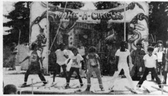
Cinco de Mayo