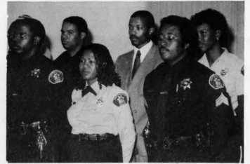
Farewell & Welcoming Celebration