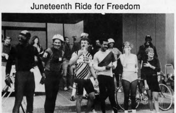
Juneteenth Ride for Freedom