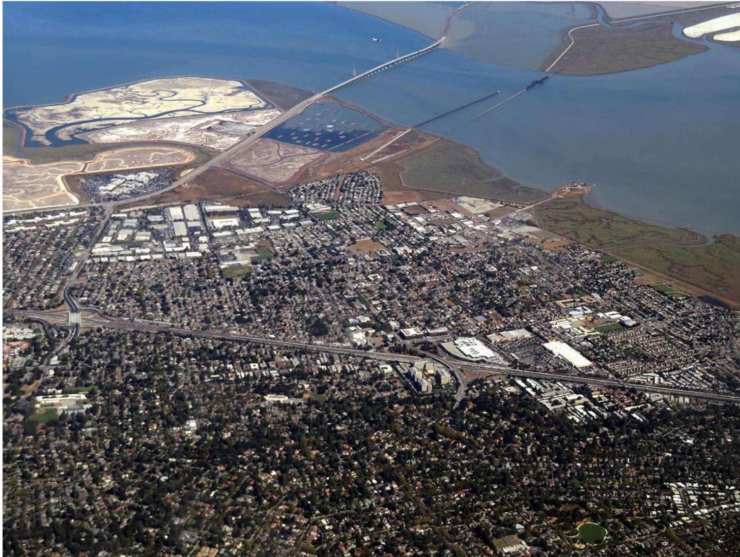
An aerial view of East Palo Alto.