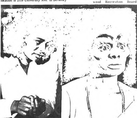
A WOMAN POSSESSED — Lovely, young Carol Speed pensively gazes at herself as a woman possessed in American International Pictures' new thriller ABBY , in which she plays the title role. Co-starring with distinguished actor William Marshall, who portrays a prominent churchman archaeologist, Ms. Speed portrays his daughter-in-law who becomes possessed of an

ETTA JAMES "Let's get all the way down" with sister Etta James, appearing at the Keystone Berkeley on October 27th. The location is 2119 University Ave. in Berkeley.