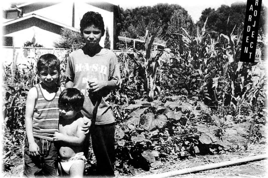
The Weeks Street Garden attracts kids from the area to romp and play, and learn how to sustain a garden.

Our many thanks go to the numerous BAA Midtown Garden volunteers, and to our friends at the Palo Alto Co-op for precious water.