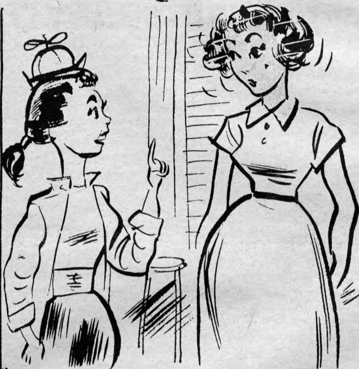
"BUT HOW DO MOTHERS LEARN THE THINGS THEY TELL DAUGHTERS NOT TO DO?!"