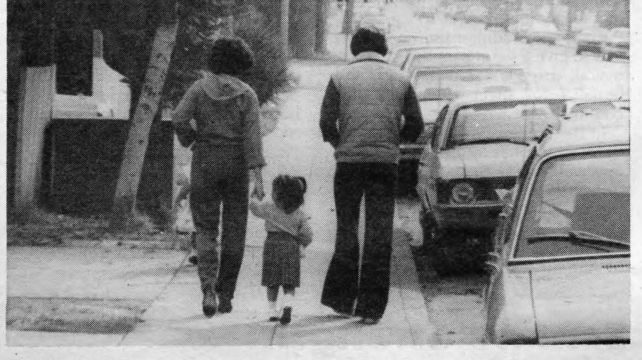
Not everyone in East Palo Alto was indoors on Superbowl Sunday.

People supporting a rent control ordinance noted that the free market simply hadn't worked from a renter's perspective. According to Dr. David Cox, rents increased at a rate of higher than 17% over the past two years, while the consumer price index rose only 9%. He said that apartments in East Palo Alto are more expensive per square foot than in surrounding communities. In addition, Cox and others observed that a free market system has produced little additional building over the past two decades, and, conse